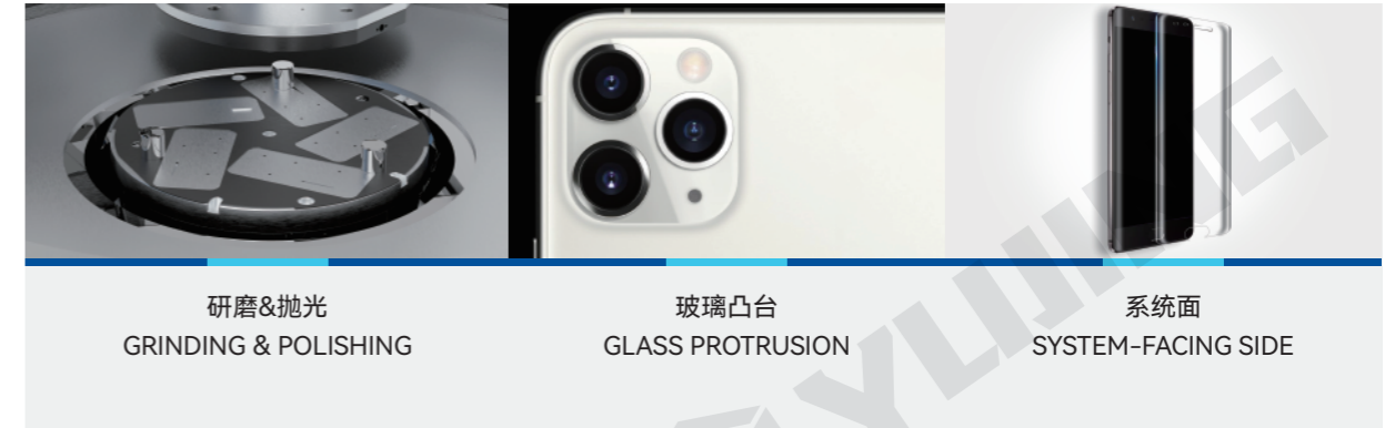
研磨&抛光 GRINDING & POLISHING